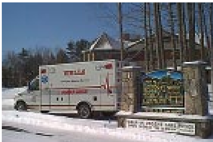
Rural EMS providers, like this one in Wells, Maine, face severe challenges in training and reimbursement.

maintenance can more than double that cost) and sends it out on 100 runs a year over its 10-year life span, it cost the provider $100 per run. But if the ambulance goes out on 200 runs per year, it only costs the provider $50 per run. Whether the ambulance service loses money, breaks even, or makes a profit depends on the per run reimbursement rate they receive from Medicare, private insurers, or the patients themselves.