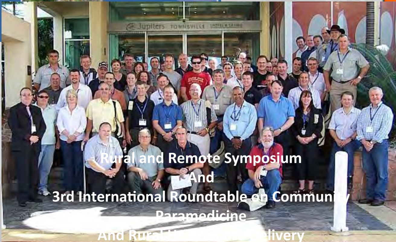
Rural and Remote Symposium And 3rd International Roundtable on Community Paramedicine And Rural Health Care Delivery Townsville 19-21 September 2007