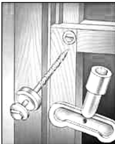
These are two of a number of available window safety devices

If the problem has not been taken care within a reasonable amount of time, contact your local City of Toronto Municipal Licensing and Standards office and file a complaint.